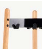
Black / white powder coated steel frame